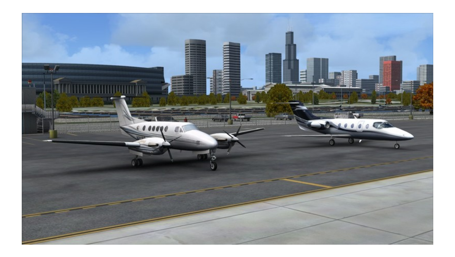
Download ->>->> http://bit.lv/2SJbIAa

FSX: Steam Edition - Meigs Field (KCGX) Add-On Free Download [hacked]