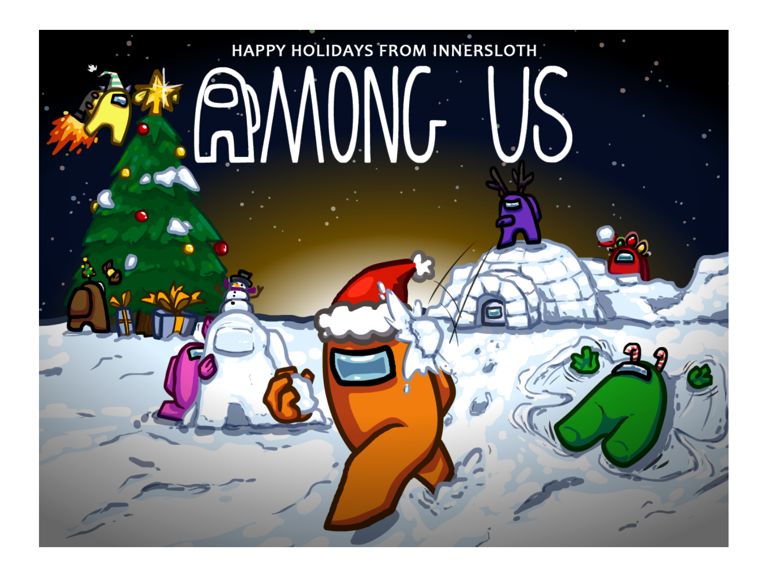
New stuff!. Server Issues and a new update!: