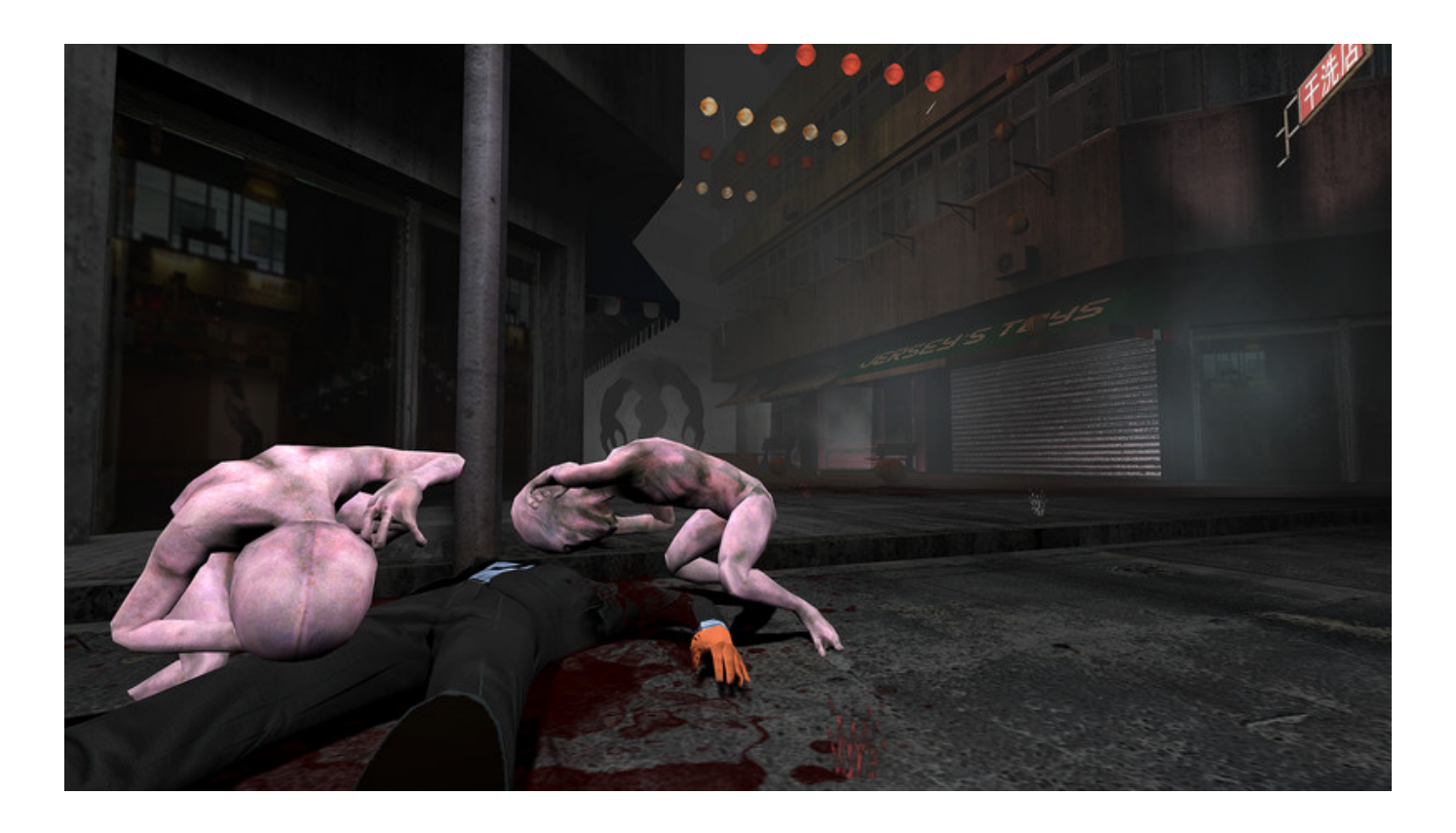
Vee Rethak - Deep Under The Mountain Torrent Download [crack]